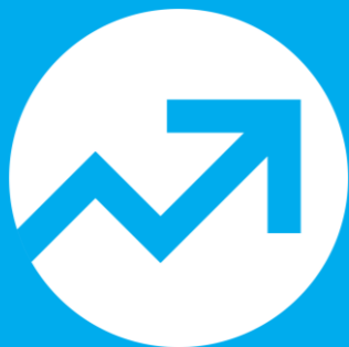
FUTURES TRADING BOT

FuturesSamFoundationBot, a Shibstate product, seamlessly integrates centralized exchange spot functionality with a unique chance factor. It allows traders to buy and sell assets at prevailing market prices, settling transactions 'on the spot' immediately after both buyer and seller orders are filled. This dynamic robot enhances user experiences, showcasing Shibstate's commitment to cutting-edge innovation in the centralized exchange space.